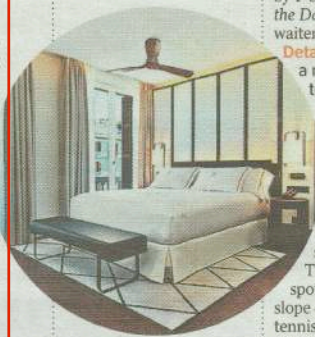
Grand Hotel Montesos, Ibiza. Below left: The Ashbee Hotel, Taormina

With the feel of a traditional Canarian village and sitting on the beachfront, the chic Bahia del Duque is a great place for early sun, with highs of 20C in April. The resort has arguably the best spot in Costa Adeje, with gardens that slope down to the beach. There are tennis courts and pools, as well as a handful of restaurants and a L'Occitane spa. By May the temperature reaches the mid-twenties. Details Room-only doubles cost from €304 (00 34 922 74 69 32, bahia-duque.com)