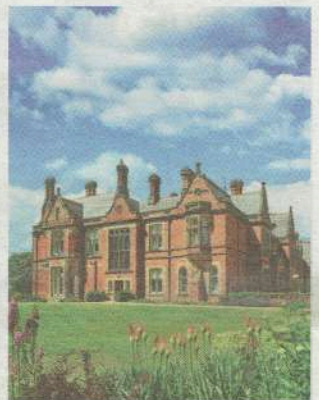
Plus: Travel Britain's best spring breaks